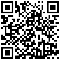
Request for Hearing